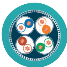
Ethernet 10 Gbit [94F]