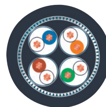
Ethernet for rail applications [94S]