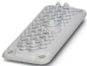
Cable feed-through plates, No. of conductors: 37, Length: 92 mm, Width: 222 mm, Height: 43 mm, Color: light gray

Please be informed that the data shown in this PDF Document is generated from our Online Catalog. Please find the complete data in the user's documentation. Our General Terms of Use for Downloads are valid ( http://phoenixcontact.com/download )