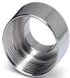
Extension adapter, Cable gland material: Nickel-plated brass, Nickel-plated brass, Connecting thread: Pg13.5

Please be informed that the data shown in this PDF Document is generated from our Online Catalog. Please find the complete data in the user's documentation. Our General Terms of Use for Downloads are valid ( http://phoenixcontact.com/download )