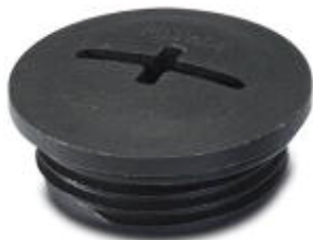
The figure shows version A-INSP-M25-65N-P-BK

Filler plugs, Cable gland material: Polyamide fiberglass reinforced, Connecting thread: Pg29, Color: black