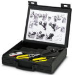
Tool set for PCF assembly, for 200/230 \mu\text{m} , 50/200/230 \mu\text{m} , and 62.5/200/230 \mu\text{m} PCF fibers

Please be informed that the data shown in this PDF Document is generated from our Online Catalog. Please find the complete data in the user's documentation. Our General Terms of Use for Downloads are valid ( http://phoenixcontact.com/download )