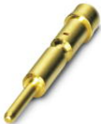
Turned 1.0 mm crimp contact, single male contact, conductor cross section 0.14 - 0.5 mm 2 , gold-plated

Please be informed that the data shown in this PDF Document is generated from our Online Catalog. Please find the complete data in the user's documentation. Our General Terms of Use for Downloads are valid ( http://phoenixcontact.com/download )