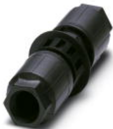
Cable connector panel feed-through, two-sided with QPD nut, black, 4+PE-pos., 1.0 mm 2 ... 2.5 mm 2 /690 V/20 A, for cable diameter of 6 mm ... 11 mm.

Please be informed that the data shown in this PDF Document is generated from our Online Catalog. Please find the complete data in the user's documentation. Our General Terms of Use for Downloads are valid ( http://phoenixcontact.com/download )