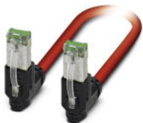
Sercos III patch cable, shielded, star quad, AWG 22 stranded (7-wire), RAL 3020 (traffic red), RJ45 connector/IP 20, angled, to RJ45 connector/IP20, angled, length: 2.0 m

Please be informed that the data shown in this PDF Document is generated from our Online Catalog. Please find the complete data in the user's documentation. Our General Terms of Use for Downloads are valid ( http://phoenixcontact.com/download )