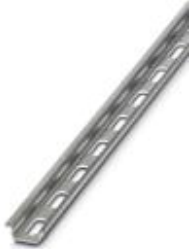
DIN rail, material: Aluminum, perforated, height 5.5 mm, width 15 mm, length: 2 m

Please be informed that the data shown in this PDF Document is generated from our Online Catalog. Please find the complete data in the user's documentation. Our General Terms of Use for Downloads are valid ( http://phoenixcontact.com/download )