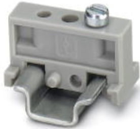
End clamp, width: 6.2 mm, color: gray

Please be informed that the data shown in this PDF Document is generated from our Online Catalog. Please find the complete data in the user's documentation. Our General Terms of Use for Downloads are valid ( http://phoenixcontact.com/download )