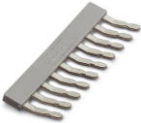
Insertion bridge, Number of positions: 10, Color: gray

Please be informed that the data shown in this PDF Document is generated from our Online Catalog. Please find the complete data in the user's documentation. Our General Terms of Use for Downloads are valid ( http://phoenixcontact.com/download )