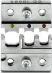
Die for CF 500 crimping machine, for solar contacts, 2.5 mm 2 , 4 mm 2 , 6 mm 2

Please be informed that the data shown in this PDF Document is generated from our Online Catalog. Please find the complete data in the user's documentation. Our General Terms of Use for Downloads are valid ( http://phoenixcontact.com/download )