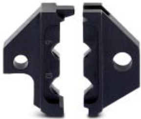
Spare die for CRIMPFOX-TC 10

Please be informed that the data shown in this PDF Document is generated from our Online Catalog. Please find the complete data in the user's documentation. Our General Terms of Use for Downloads are valid ( http://phoenixcontact.com/download )