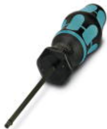
Torque screwdriver, with preset torque of 0.2 Nm and 4 mm hexagonal drive for M8 connectors

Please be informed that the data shown in this PDF Document is generated from our Online Catalog. Please find the complete data in the user's documentation. Our General Terms of Use for Downloads are valid ( http://phoenixcontact.com/download )