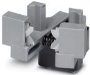
Replacement knife for the automatic stripping and crimping device CF 3000-2,5

Please be informed that the data shown in this PDF Document is generated from our Online Catalog. Please find the complete data in the user's documentation. Our General Terms of Use for Downloads are valid ( http://phoenixcontact.com/download )