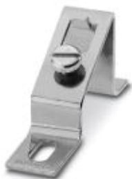
Angled brackets with M6 screw, DIN rail limit stop, for fixing DIN rails at an angle of 30°, with M6 screw, height: 35.4 mm

Please be informed that the data shown in this PDF Document is generated from our Online Catalog. Please find the complete data in the user's documentation. Our General Terms of Use for Downloads are valid ( http://phoenixcontact.com/download )