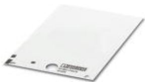
The figure shows a version of the article

Plastic label, Card, blue, unlabeled, can be labeled with: THERMOMARK CARD, Mounting type: Adhesive, Lettering field: 104 x 140 mm