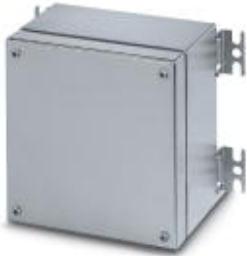
Terminal box, with cover installed, including mounting plate, without flange plates, Material: Stainless steel, 316L/1.4404, Surface: brushed, silver, 300 mm x 300 mm x 120 mm, Type of locking: Screw-on cover

Please be informed that the data shown in this PDF Document is generated from our Online Catalog. Please find the complete data in the user's documentation. Our General Terms of Use for Downloads are valid ( http://phoenixcontact.com/download )