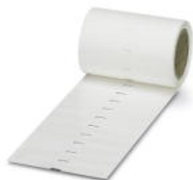
High-temperature label, for thermal transfer printers, resistant for 60 s at up to 300°C

Please be informed that the data shown in this PDF Document is generated from our Online Catalog. Please find the complete data in the user's documentation. Our General Terms of Use for Downloads are valid ( http://phoenixcontact.com/download )