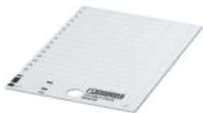
The figure shows the US-EMLP (20x9) version in white

Plastic label, can be ordered: By card, red, labeled according to customer specifications, Mounting type: Adhesive, Lettering field: 52.5 x 15 mm