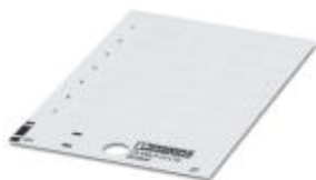
The figure shows the US-EMLP (27x18) version in white

Plastic label, Card, yellow, unlabeled, can be labeled with: THERMOMARK CARD, Mounting type: Adhesive, Lettering field: 40 x 10 mm