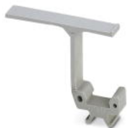
Group marking label, snaps into terminal center for push-in terminal blocks ...1.5/S, Lettering field 25 x 3.5 mm, pitch 3.5 mm, labeled with EML (24 x 3)R

Please be informed that the data shown in this PDF Document is generated from our Online Catalog. Please find the complete data in the user's documentation. Our General Terms of Use for Downloads are valid ( http://phoenixcontact.com/download )