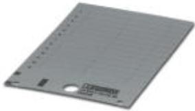
The figure shows a version of the article

Plastic label, can be ordered: By card, silver, labeled according to customer specifications, Mounting type: Adhesive, Lettering field: 60 x 30 mm