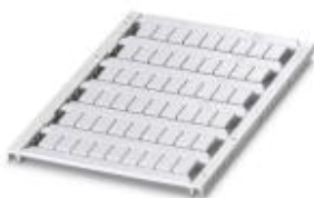
The figure shows an unlabeled version in white

Marker for terminal blocks, can be ordered: by sheet, white, labeled according to customer specifications, Mounting type: Snap into tall marker groove, Lettering field: 6 x 10 mm