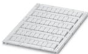
The figure shows the unlabeled version

Marker for terminal blocks, can be ordered: by sheet, white, labeled according to customer specifications, Mounting type: Snap into tall marker groove, for terminal block width: 6.2 mm, Lettering field: 5.55 x 10 mm