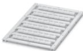
The figure shows an unlabeled version in white

Marker for terminal blocks, can be ordered: by sheet, violet, labeled according to customer specifications, Mounting type: Snap into flat marker groove, for terminal block width: 8.2 mm, Lettering field: 7.4 x 4.7 mm