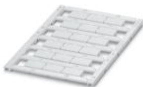
The figure shows an unlabeled version in white

Marker for terminal blocks, can be ordered: by sheet, white, labeled according to customer specifications, Mounting type: Snap into tall marker groove, for terminal block width: 16 mm, Lettering field: 14.8 x 9.6 mm