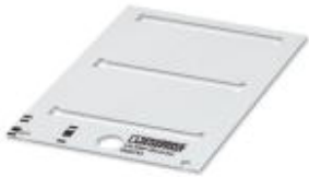
The figure shows a version of the article

Snap-in markers, Card, yellow, unlabeled, can be labeled with: THERMOMARK CARD, Mounting type: snapped into marker carrier, Lettering field: 100 x 15 mm