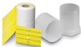
Illustration shows the product TMT 4 R YE

Marker for terminal blocks, can be ordered: By line, white, labeled according to customer specifications, Mounting type: Snap into universal marker groove, Snap into flat marker groove, for terminal block width: 4.2 mm, Lettering field: 6.35 x 4.15 mm