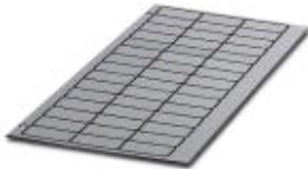
The figure shows the version GPE 27x12,5 SR/R

Engraving material, can be ordered: by sheet, silver, labeled according to customer specifications, Mounting type: Adhesive, Lettering field: 27 x 18 mm