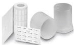
The figure shows the EML (20X8)R product variant

Label, can be ordered: By line, white, labeled according to customer specifications, Mounting type: Adhesive, Lettering field: 38.1 x 19 mm