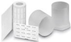
The figure shows the EML (20X8)R product variant

Label, Roll, white, unlabeled, can be labeled with: THERMOMARK ROLL, THERMOMARK ROLL X1, THERMOMARK X, THERMOMARK S1.1, Mounting type: Adhesive, Lettering field: 110 x 40000 mm