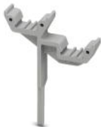
Marker carriers, gray, unlabeled, Mounting type: Plug in, Lettering field: 4 x 10.5 mm

Please be informed that the data shown in this PDF Document is generated from our Online Catalog. Please find the complete data in the user's documentation. Our General Terms of Use for Downloads are valid ( http://phoenixcontact.com/download )