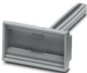
Terminal strip marker carrier, gray, unlabeled, Mounting type: Plug in, Lettering field: 20 mm x 8 mm

Please be informed that the data shown in this PDF Document is generated from our Online Catalog. Please find the complete data in the user's documentation. Our General Terms of Use for Downloads are valid ( http://phoenixcontact.com/download )