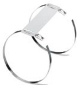
Steel cable tie, rust-proof, anti-magnetic

Please be informed that the data shown in this PDF Document is generated from our Online Catalog. Please find the complete data in the user's documentation. Our General Terms of Use for Downloads are valid ( http://phoenixcontact.com/download )