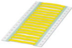
The illustration shows WMS 6,4 (30X10)R

Shrink sleeve, Roll, yellow, unlabeled, can be labeled with: THERMOMARK W, THERMOMARK ROLL, THERMOMARK ROLL X1, THERMOMARK X1.2, Perforated, Lettering field: 60 x 5 mm