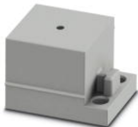
Small, slotted cable sleeves suitable for cables with a diameter of 3 ... 4 mm, material: SEBS

Please be informed that the data shown in this PDF Document is generated from our Online Catalog. Please find the complete data in the user's documentation. Our General Terms of Use for Downloads are valid ( http://phoenixcontact.com/download )