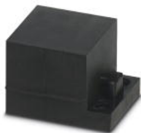
Small blind sleeve, material: NBR

Please be informed that the data shown in this PDF Document is generated from our Online Catalog. Please find the complete data in the user's documentation. Our General Terms of Use for Downloads are valid ( http://phoenixcontact.com/download )