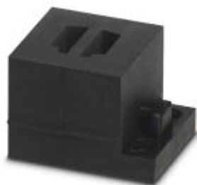
Small, slotted cable sleeves suitable for two AS-i cables (L-R), material: NBR, version: left, right

Please be informed that the data shown in this PDF Document is generated from our Online Catalog. Please find the complete data in the user's documentation. Our General Terms of Use for Downloads are valid ( http://phoenixcontact.com/download )