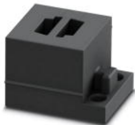
Small, slotted cable sleeves suitable for two AS-i cables (R-R), material: NBR, version: right, right

Please be informed that the data shown in this PDF Document is generated from our Online Catalog. Please find the complete data in the user's documentation. Our General Terms of Use for Downloads are valid ( http://phoenixcontact.com/download )